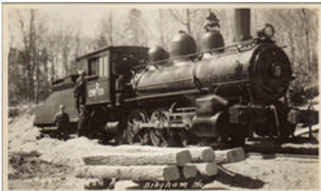
CMP Locomotive Used at Wyman Dam - Photo by Milford Baker. Used by Permission.

Saturday, April 1 7 pm Admission is FREE Congregational Church | 7 Meadow Street | Bingham ME